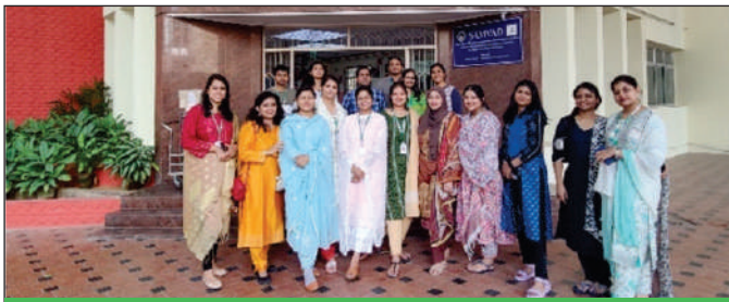
Student Study Tour to Bengaluru