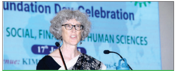
5 th Foundation Day